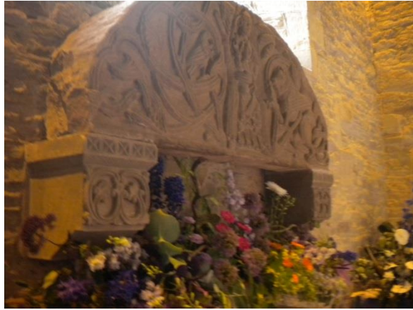
The Tympanum, Fownhope Church