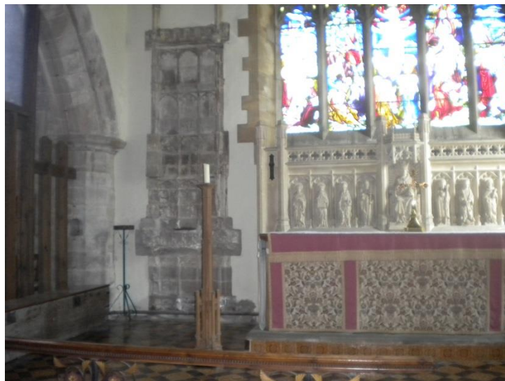
Above right: Leominster Priory Church Above: Leintwardine Church

See MHS website for full details - mortimerhistorysociety.org.uk