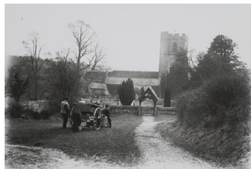
Hentland church c1920s

To qualify for the Heritage Lottery Fund the Hentland PCC invite the community to be involved, to widen the interest of the church and its place in history and the landscape. Please join us and help with the following activities: