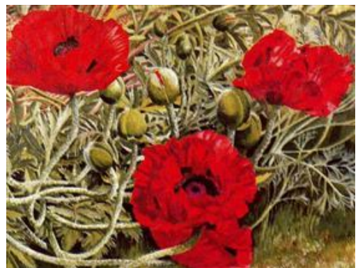
Stanley Spencer's Poppies

More details on Poppies: weeping window website.