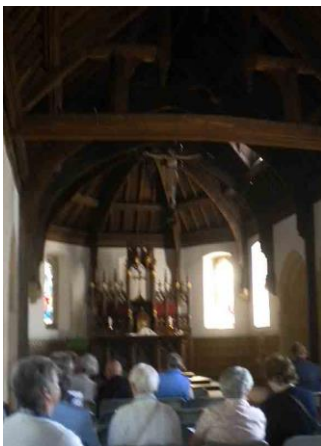
St Winifred window in the Lubienski side chapel