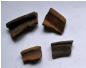
Medieval pottery from Gillow