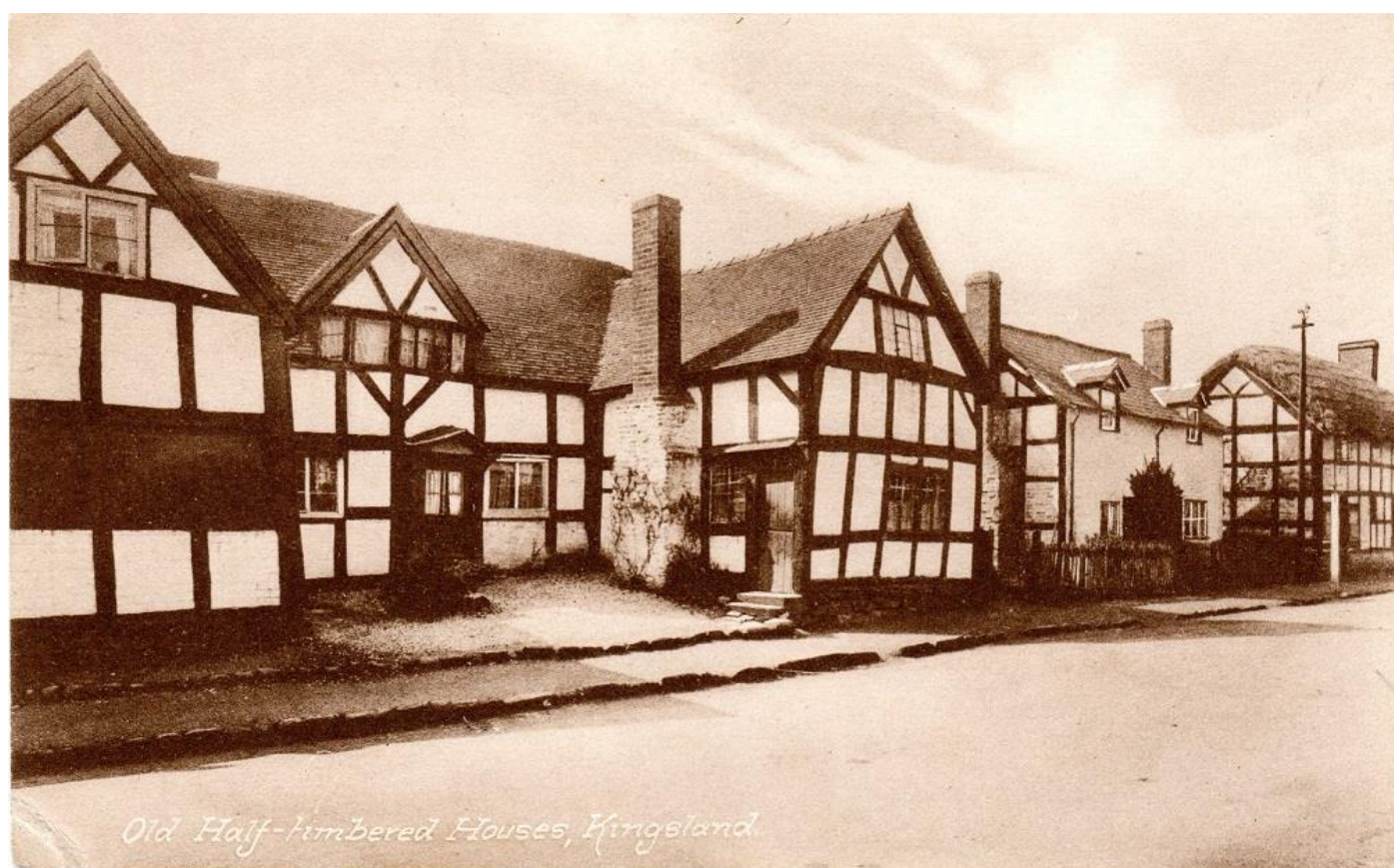
Kingsland postcards – date unknown