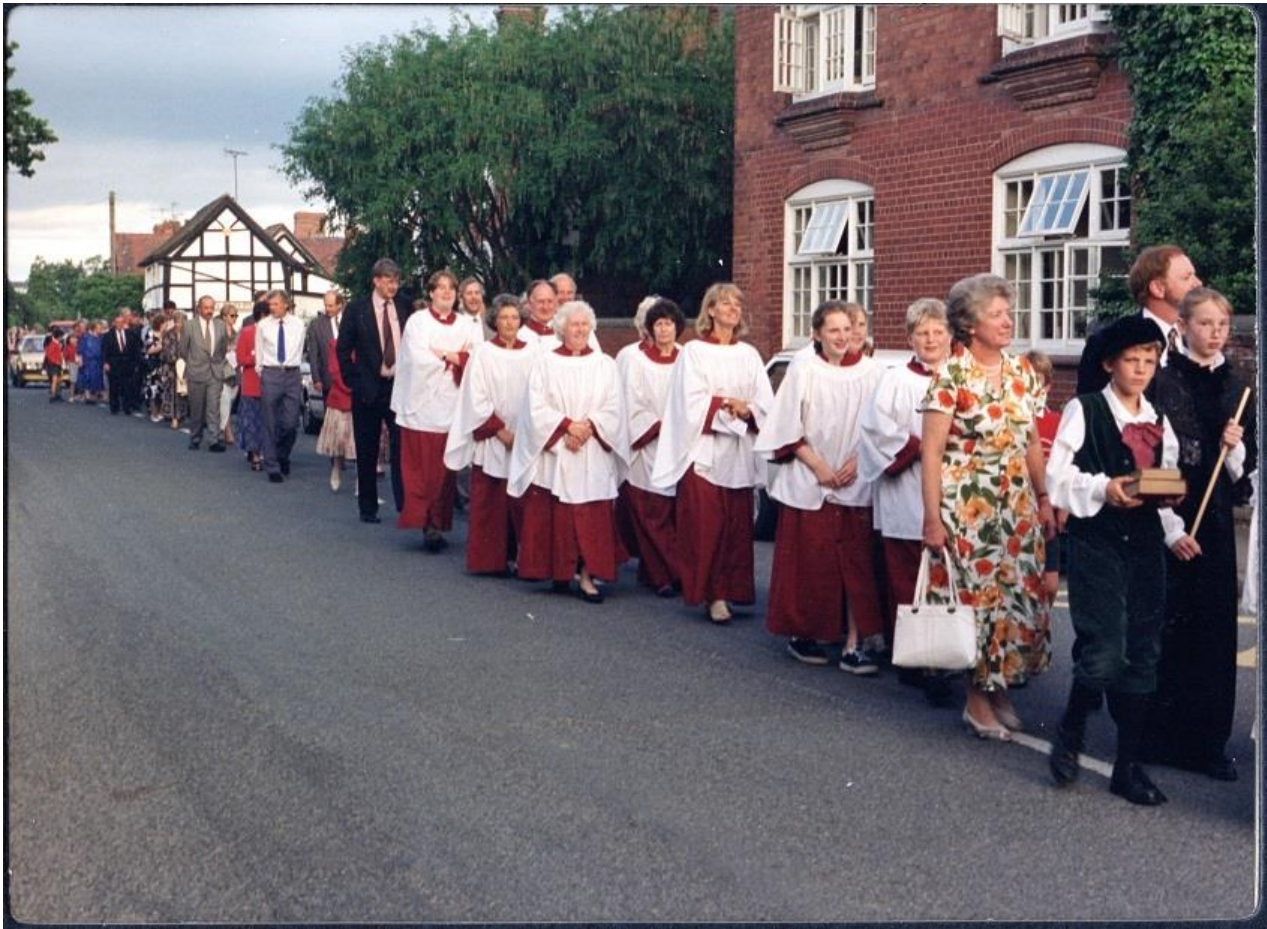
Kingsland School 150 th Anniversary parade