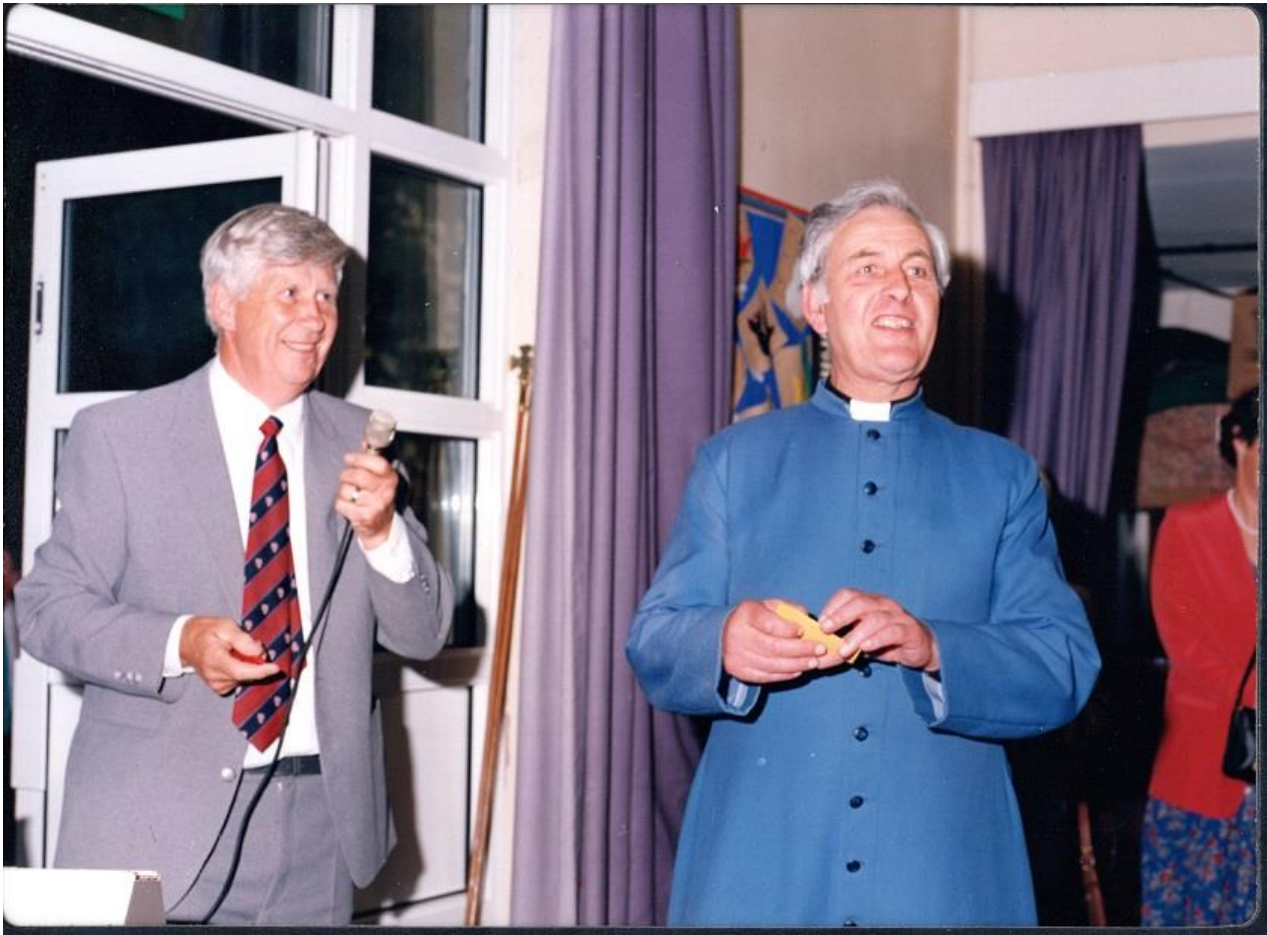
Kingsland School 150 th anniversary 1996