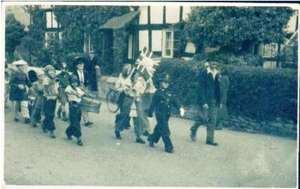
1 st August Bank Holiday Parade from The Corners to the PO to The Rectory to the fields behind the school.