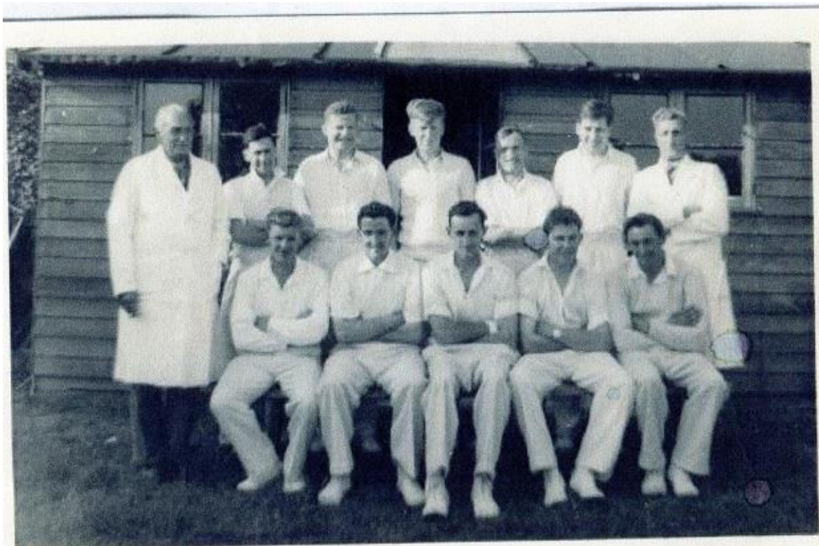
Cricket team (first team) 1960