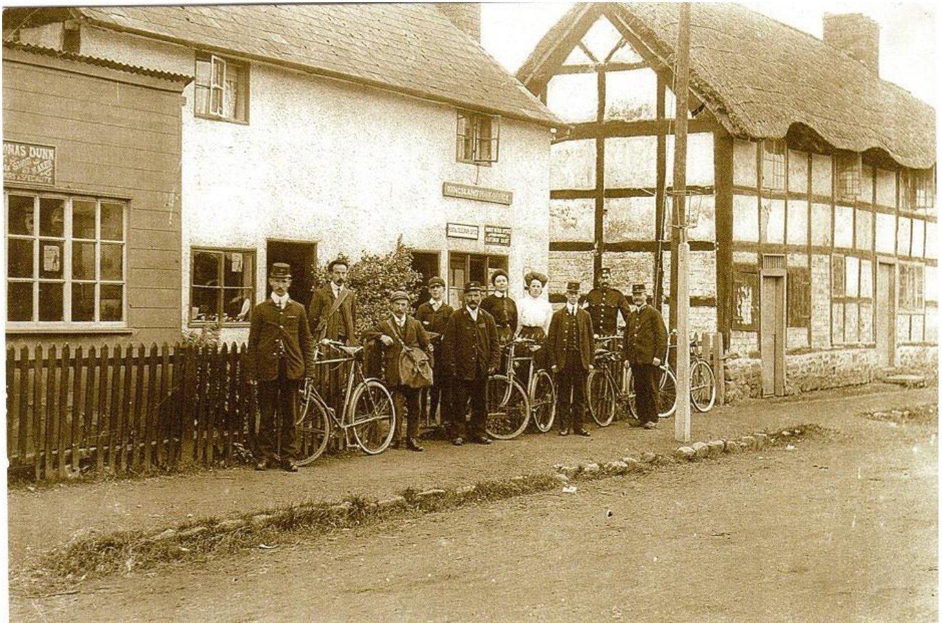
Old Kingsland Post Office next to Markham's garage